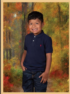
BG2 Default if background not chosen